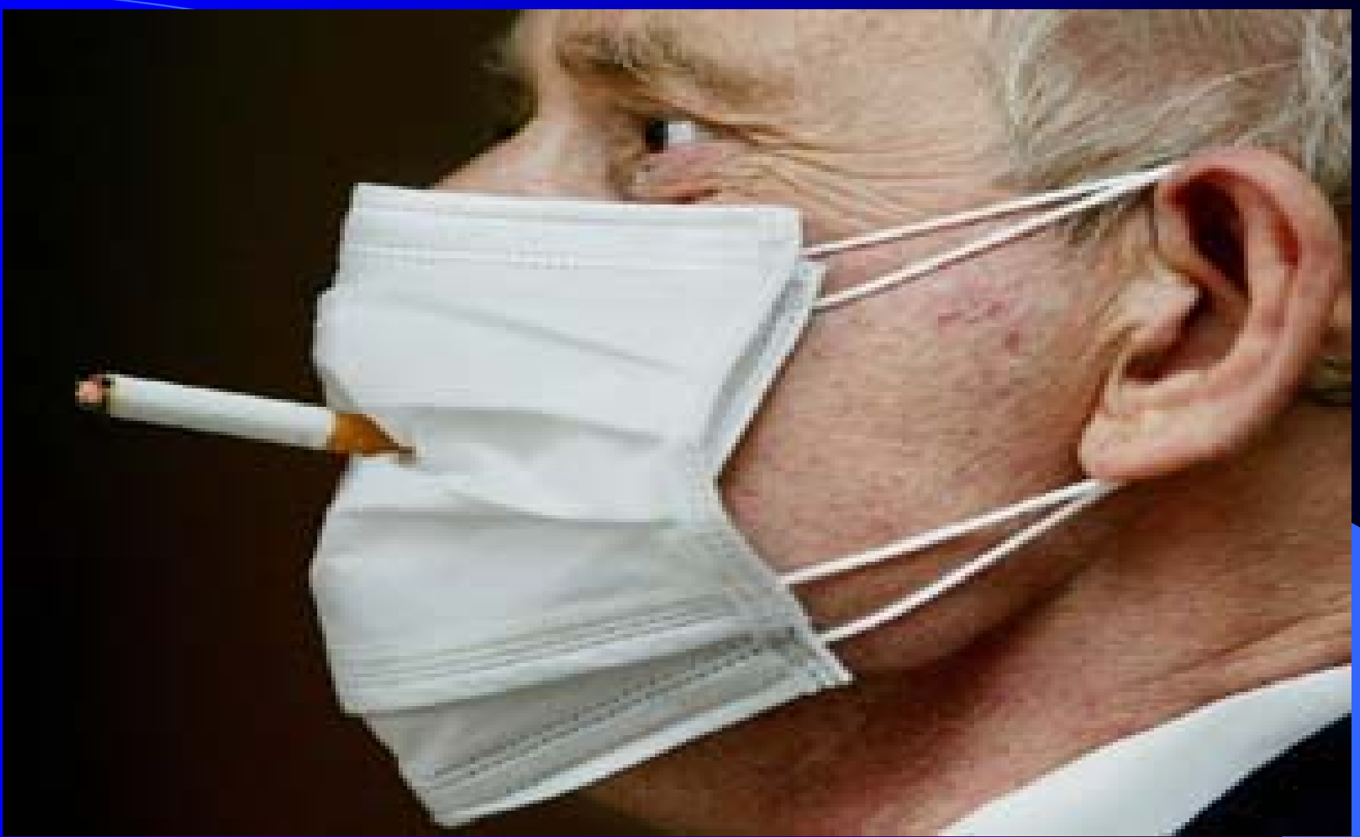
Wearing a mask to guard against SARS, a Toronto SURGEON takes a puff break outside St. Michael's Hospital